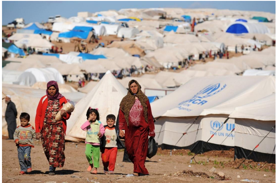
Syrian Refugee Camps in Jordan