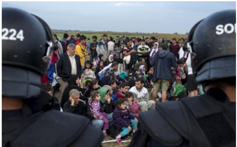
Refugees being stopped at European Borders