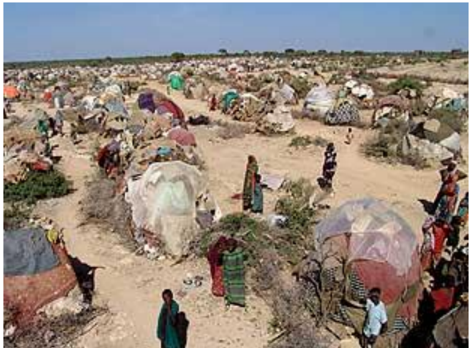
Somali Refugee Camps in North Africa