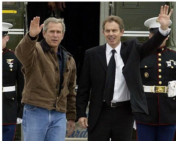
Bush & Blair

Both of those countries are still at war and hundreds of thousands of innocent civilians have died in those two countries for the death of the 2,977 people who died on Sept. 11, 2002 in New York. One horrific act of violence perpetrated on innocent people in New York by 20 – 33 old misguided and conscienceless (regardless of their cause) young men, was followed by an out-of-proportion, egregious, massive acts of war on largely innocent populations of entire countries by the supposedly rational, seasoned and moral leaders of the free World. So much for exporting western values of justice, fairness and moral rectitude by the then leaders of the U.S. and England ( George W. Bush and his 'Yes' man Prime Minister Tony Blair ).